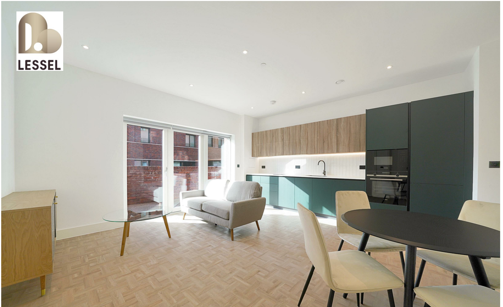
2 Viridis Apartments Monarch Square, London, SW11 1BZ £738 Per Week